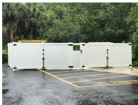
Recyclables ONLY – (No Food)

Waste) Large Items, Furniture, Electronics, Appliances, Etc. Are Not Permitted in the Dumpster