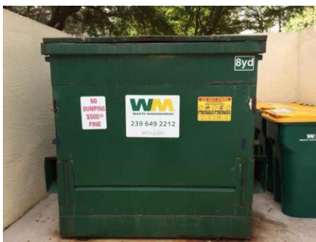
Garbage and Food Waste