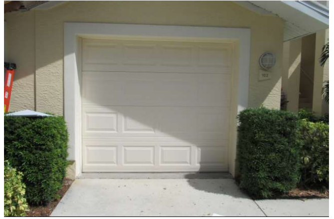
Outside Garage Door