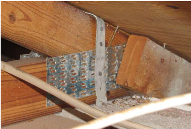
Roof To Wall Connection - Single Wraps - Front