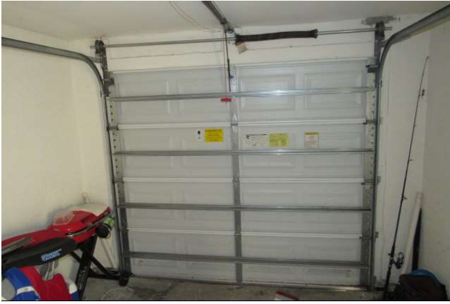
Inside Garage Door