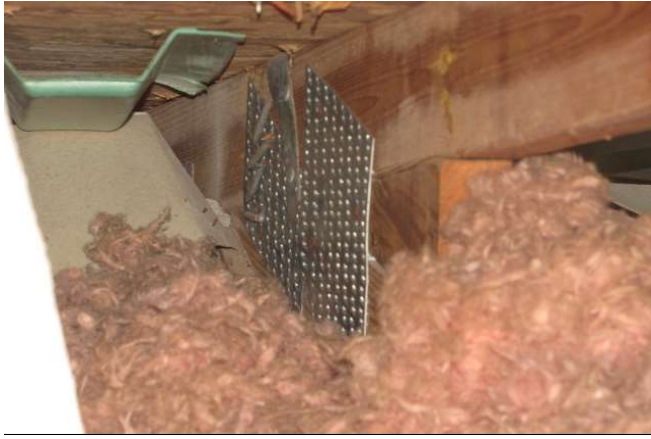
Roof To Wall Connection - Single Wraps - Back