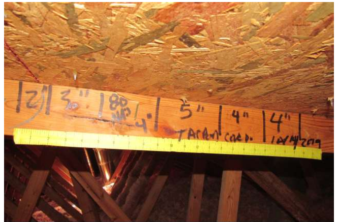
Roof Deck Connection - Nail Spacing #2