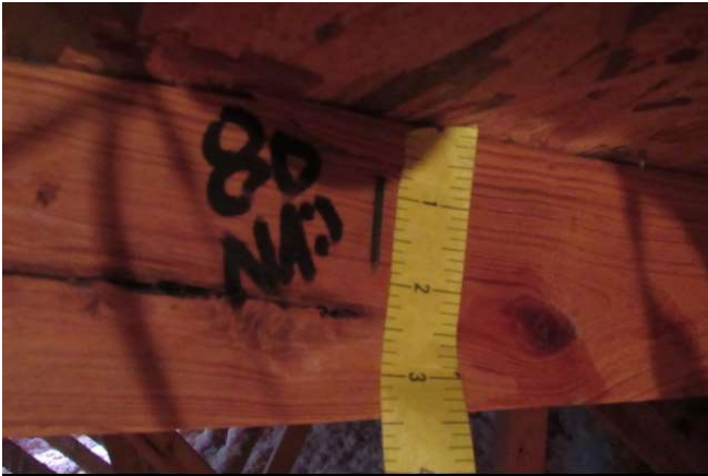
Roof Deck Connection - 8D Nail