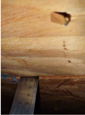
Roof Deck Thickness