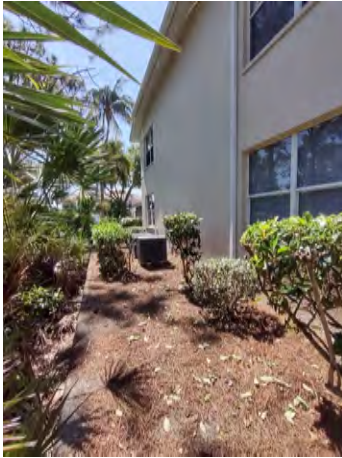
Side Elevation Right