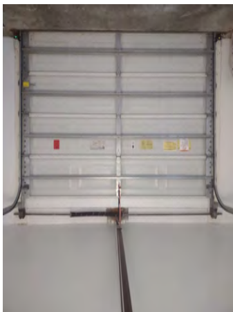
Garrage Door Inside