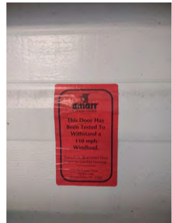
Garage door Test Sticker