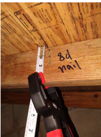
Roof Deck Connectio 8D Nail