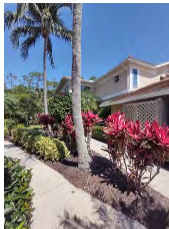
Side Elevation Left