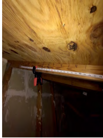
Roof Deck Connection Nail Spacing