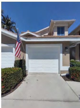
Garrage Door Outside