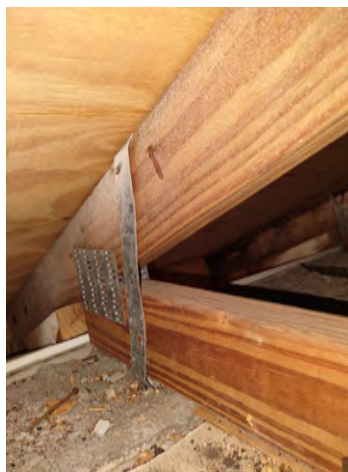
Roof to Wall Connexion Single Wrap Front