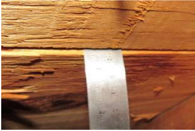
Roof deck thickness - 1/2"