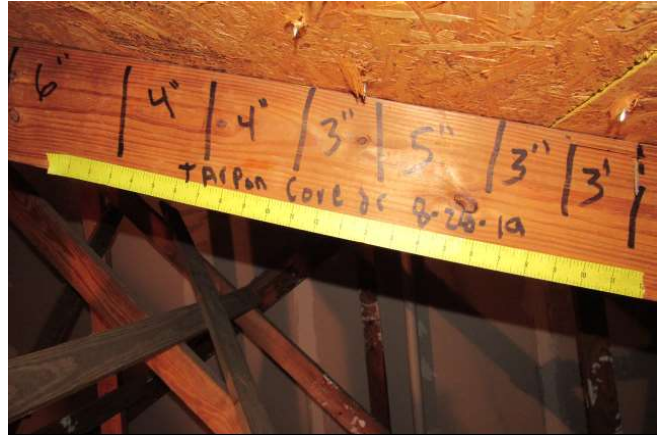
Roof Deck Connection - Nail Spacing #1