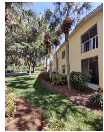
Side Elevation Right