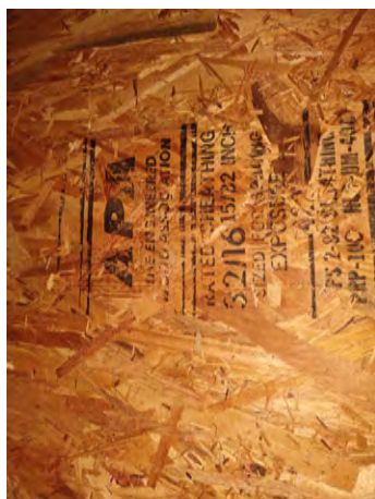
Roof Deck Thickness