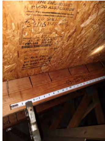
Roof Deck Connection Nail Spacing