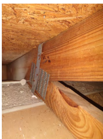
Roof to Wall Connection Single Wrap Front