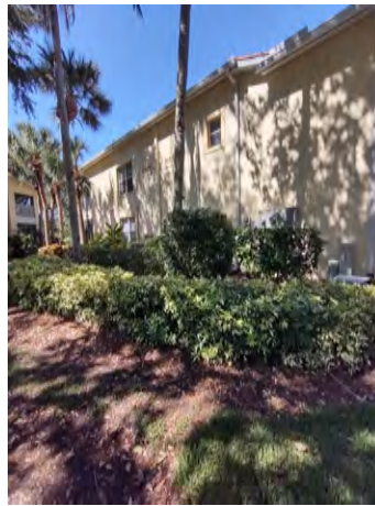
Side Elevation Left