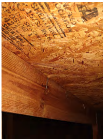
Roof Deck Connection 8D Nail