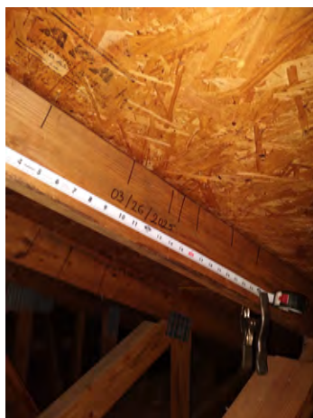
Roof Deck Connection Nail Spacing