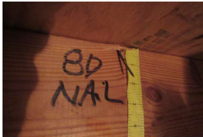
Roof Deck Connection - 8D Nail