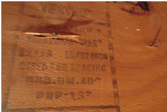
Roof deck thickness - 15/32"