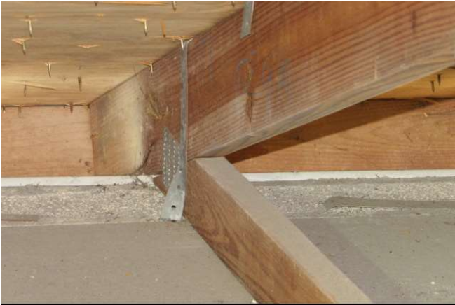
Roof To Wall Connection - Clips - Front