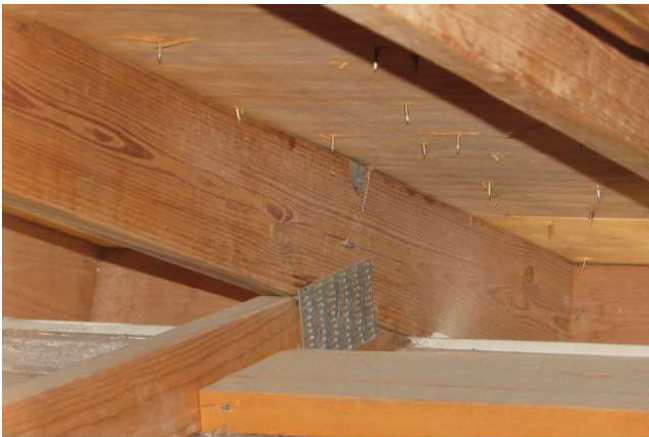
Roof To Wall Connection - Clips - Back