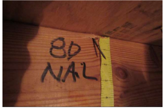
Roof Deck Connection - 8D Nail