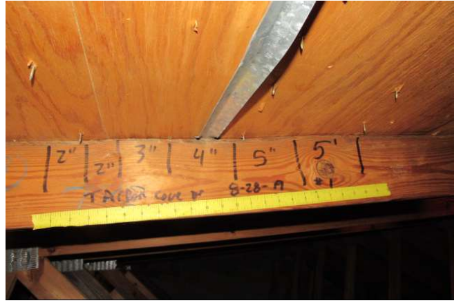
Roof Deck Connection - Nail Spacing #1