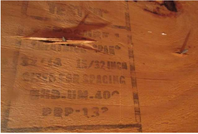
Roof deck thickness - 15/32"