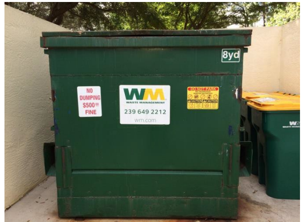
All Other Garbage and Food Waste