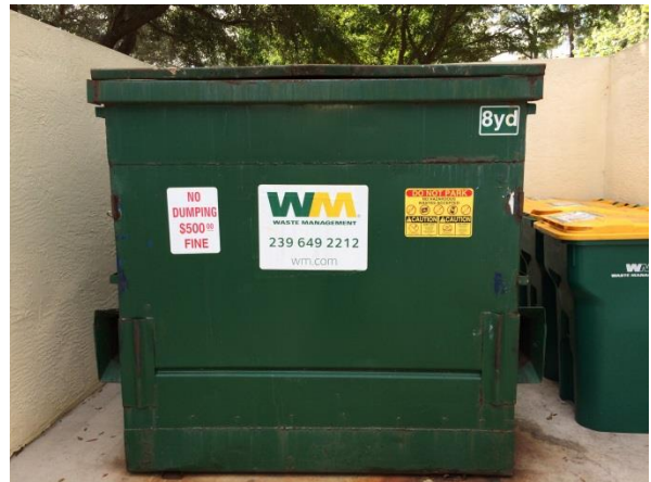
All Other Garbage and Food Waste